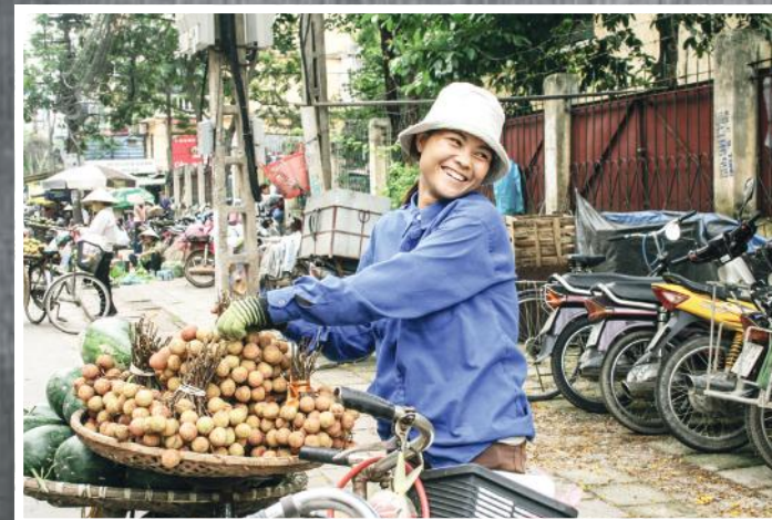
Vietnam Women's Museum has permanent displays on the history and heritage of women and their families. It has vibrant exhibition projects with stakeholder community groups. When the Hanoi Administration tried to ban street vendors endangering the livelihoods of women and their families, and the quintessential Hanoi tourist experience, the Museum's exhibition on Street Vendors resulted in the government reversing its decision. Museum used its heritage collections from the past and stories from the present to advocate social justice.

Vietnam takes the policy position that gender equity is not oppositional between men and women, but rather a space for sharing authority power and quality of life. Nations should use laws to expand the life choices and human capacity of their people. We need to unleash the creative agency of women who can contribute substantially to every aspect of social progress. Vietnam