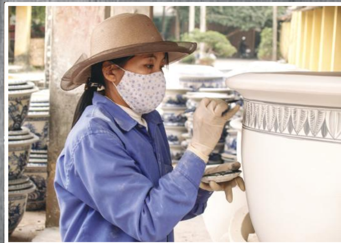
Dang Trieu, Quang Ninh Province in Vietnam, was one of the poorest villages in which I worked anywhere in the world. We used Ecomuseology as a methodology to revitalize the great late medieval ceramic heritage of the village through Public Private Partnerships. It is now one of the most livable villages in Vietnam with an annual turnover of over $ 7 million. Women are the artists in both the traditional and contemporary design and other plastic arts. Men are the potters.