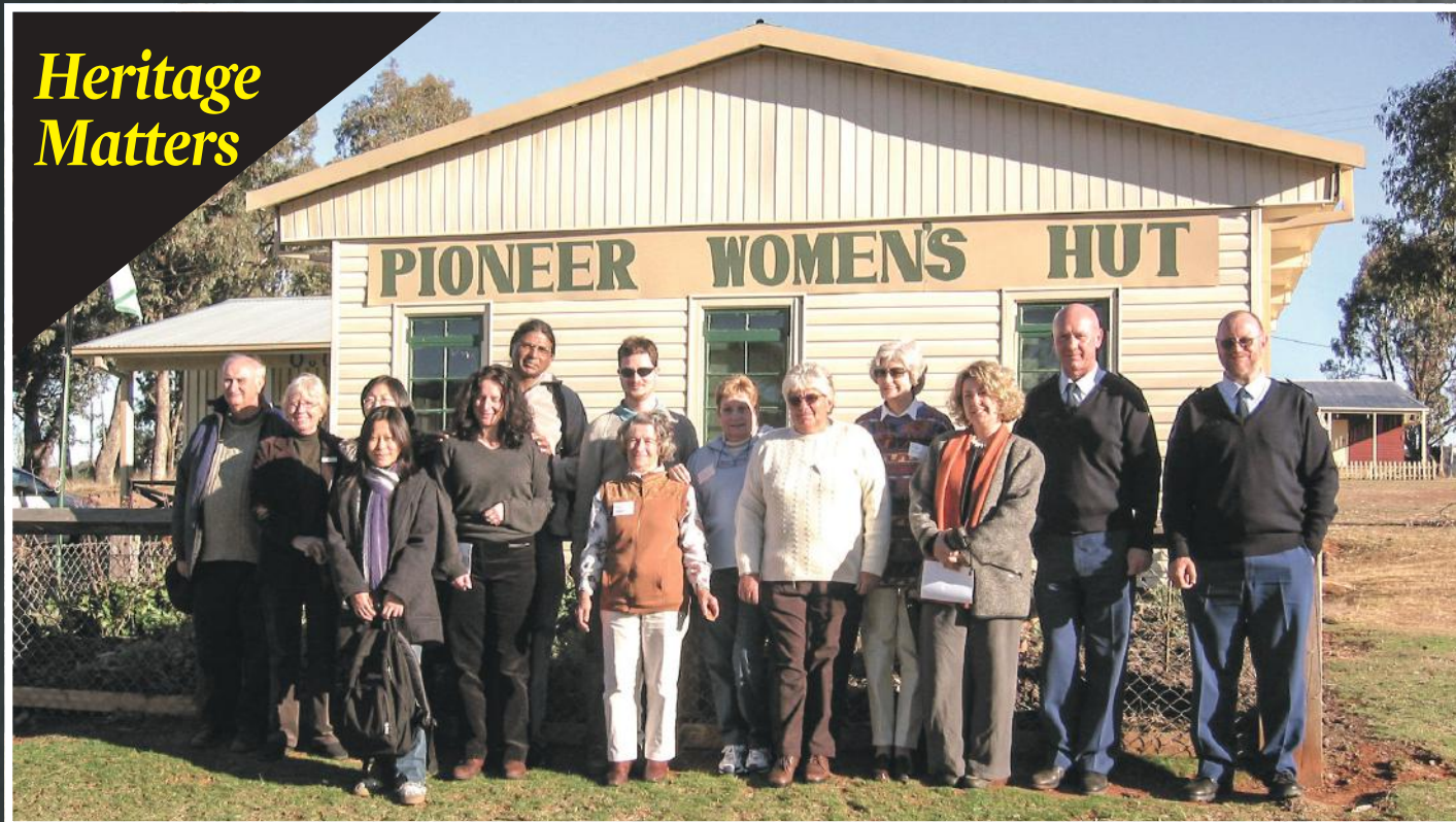
The Pioneer Women's Hut in rural Glenroy near Tumarumba in NSW, Australia, is the first women's museum in Australia established by the NSW Country Women's Association under the inspirational leadership of the late Wendy Hucker. This museum helped me with practical classes for Indigenous museum and heritage studies students. I also used it as a training space for prisoners/inmates in the second oldest prison in Australia establishing the first museum in the world entirely built and run by prisoners under the resonant leadership of the Les Strzelecki.